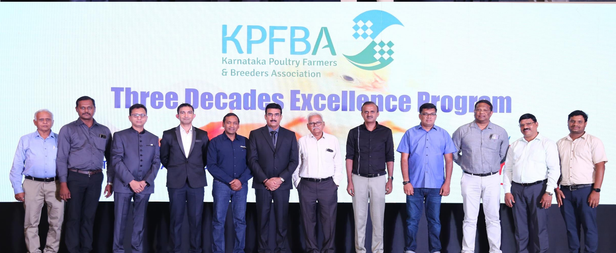
Outgoing Management Committee & Team KPFBA